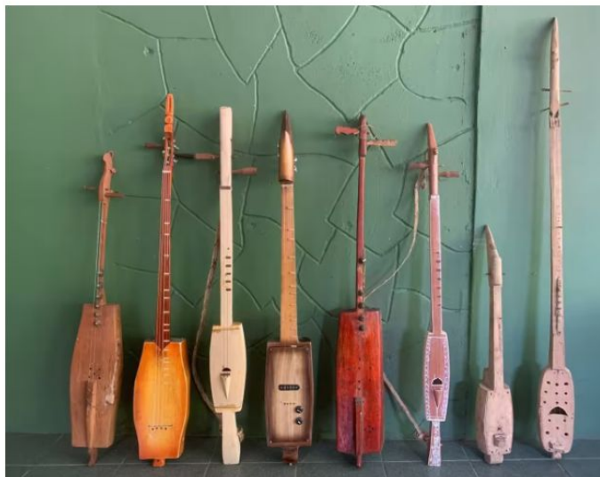
Carved from a single piece of wood, "boat lutes" are plucked string instruments with hollowed bodies that look something like dugout canoes used on Borneo's waterways by indigenous inhabitants.

MARCO FERRARESE, Contributing writer March 17, 2023 08:00 JST